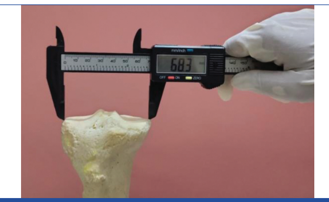
[Table/Fig-1]: Total Transverse Diameter (TD) of tibial plateau measurement using Vernier callipers.

The areas of the MTC and LTCs were measured separately and statistically analysed.